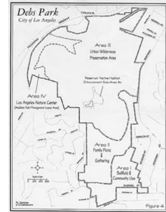
The City of Los Angeles recently established an Urban Wilderness in Debs Park, near Highland Park. Griffith Park's greater biodiversity and historic significance make it an even better candidate for such a designation.

Mail to: Los Angeles Department of Recreation & Parks, Griffith Park Master Plan, 3900 West Chevy Chase Drive, Los Angeles CA 90039